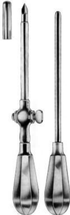
Buelau 11-1720-24 24cm/9½"