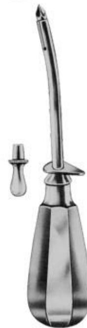
Krause 11-1724-15 15cm/6"