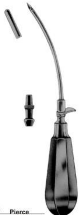
Ø Pierce mm 3.0 11-1728-03 4.0 11-1728-04 5.0 11-1728-05