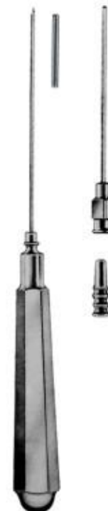
Lichtwitz 11-1721-19 19cm/7½"