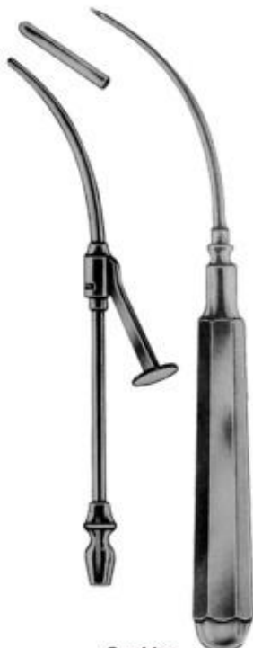
Coakley 11-1725-16 16cm/6 ⅓"