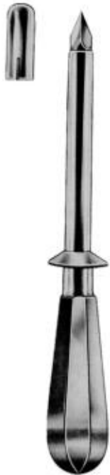
Nelson Ø mm 21cm/8½" 7.5 11-1722-07 9.0 11-1722-09 10.5 11-1722-10 12.0 11-1722-12